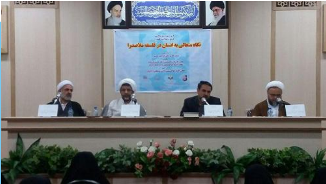
An academic-promotional session on “a Transcendent View of the Human in Mullā Ṣadrā’s Philosophy”