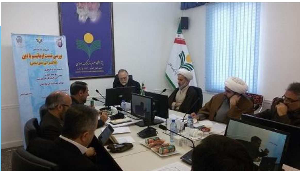
The Inquiry of the Relationship between Humanism and Religion

The academic-promotional session on “The Study of the Relationship between Humanism and Religion”