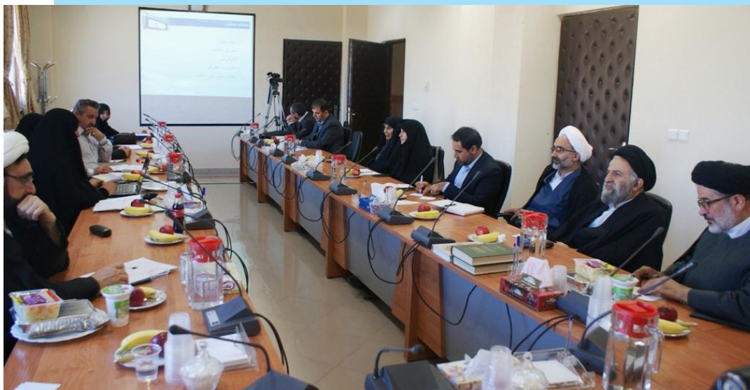
The Conference on “Human, Society and Health” in collaboration with University of Qom.

Allameh Tabataba'i University University of Qom Baqir al-Olum University Al-Zahra University Seminary Teacher Training Center for Women Research Institute of Hawzah (seminary) and University Islamic Research Institute for Culture and Thought Dar al-Hadith Scientific Cultural Institute and so on.